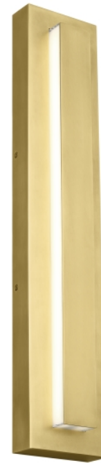
Brass (Alt Lit)